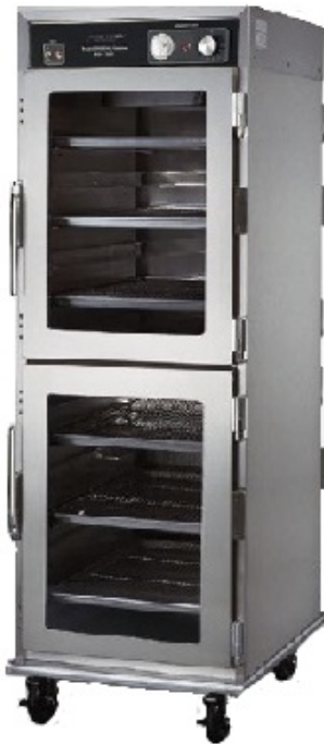
HC-15 Heated Holding Cabinet shown with electro-mechanical controls and stainless steel doors. Holds up to 15 full-size sheet pans.